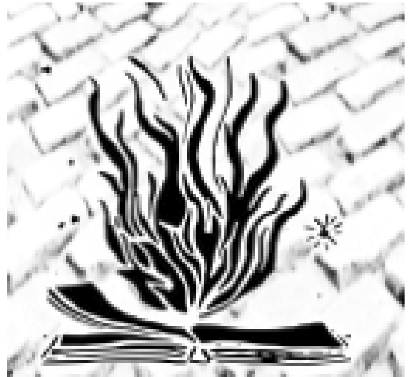
This is our logo